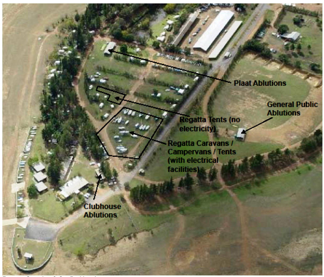
Regatta Camping & Car Parking Areas

The camping area is near the clubhouse area and is reserved for competitors and their supporters in the above demarcated areas. The one area is for tents only and has no electrical facilities. The other area is for caravans, campervans and tents and has electrical facilities. Limited amounts of additional shade will be provided in these areas.